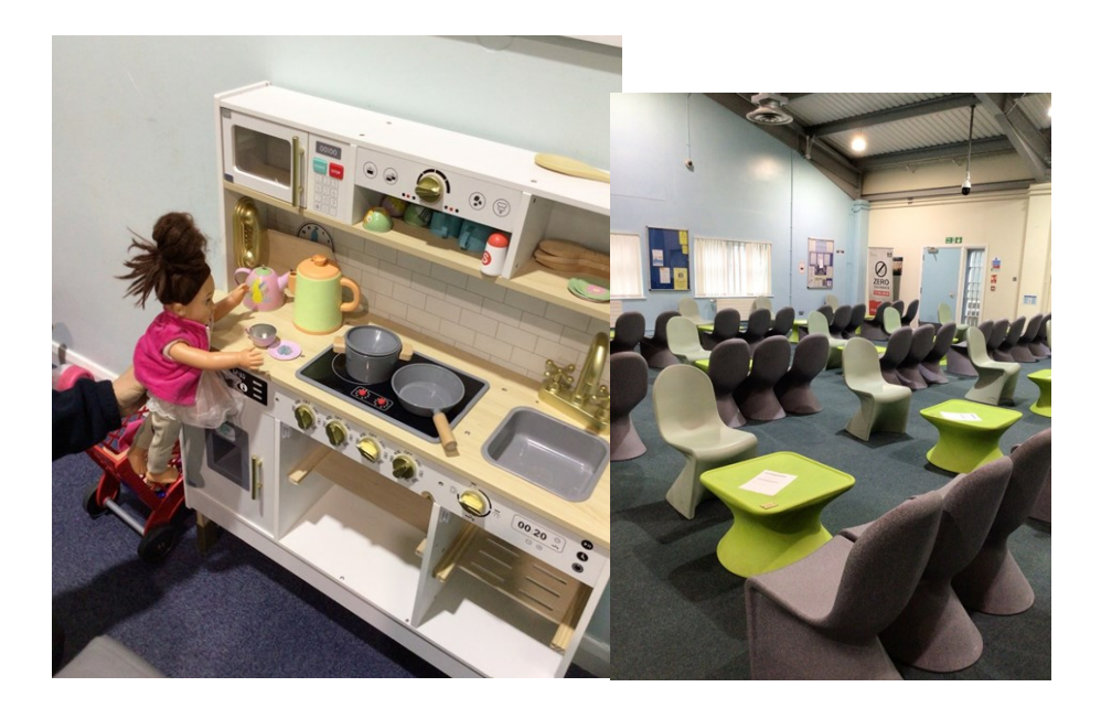
You then can go back in the room to play or see your daddy again.

You can sit in the play area and read a book or sit down and wait for a short time.