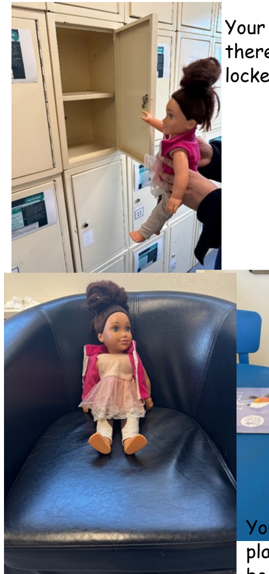
Your grown up puts all there things inside a locker .